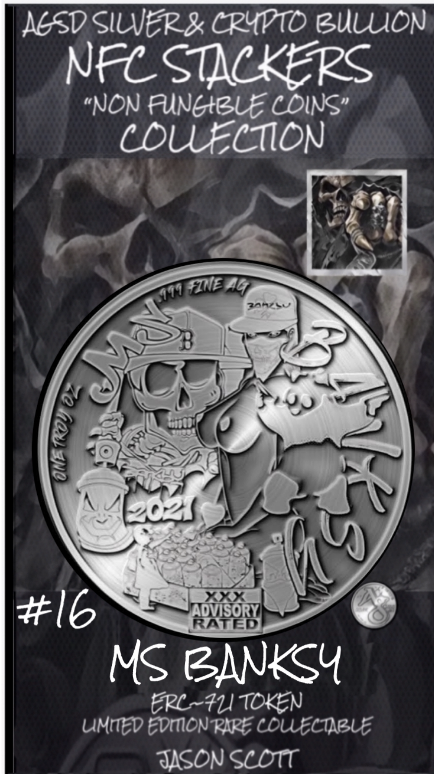
AGSD SILVER & CRYPTO NFC SILVER COIN COLLECTION 1-60 FEATURING 2 SERIES (XXX RATED NUDITY ART 1-16) & (HOUSE OF CARDS 1-7)