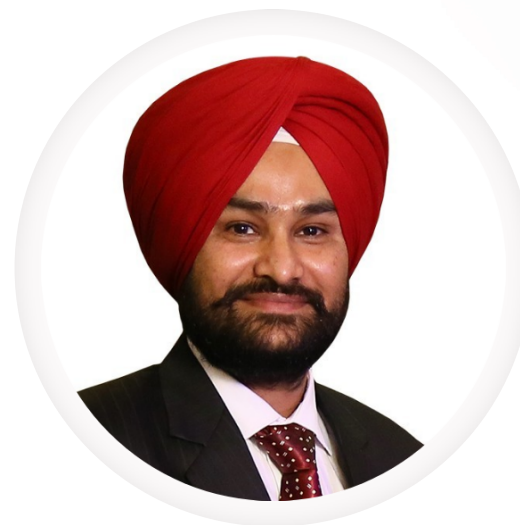
Antier Solutions Pvt. Ltd

Advisory, Management, Branding, and Marketing