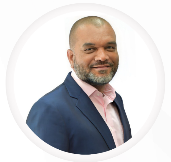
Wintertons Legal Practitioners

Advisory, Management, Branding, and Marketing