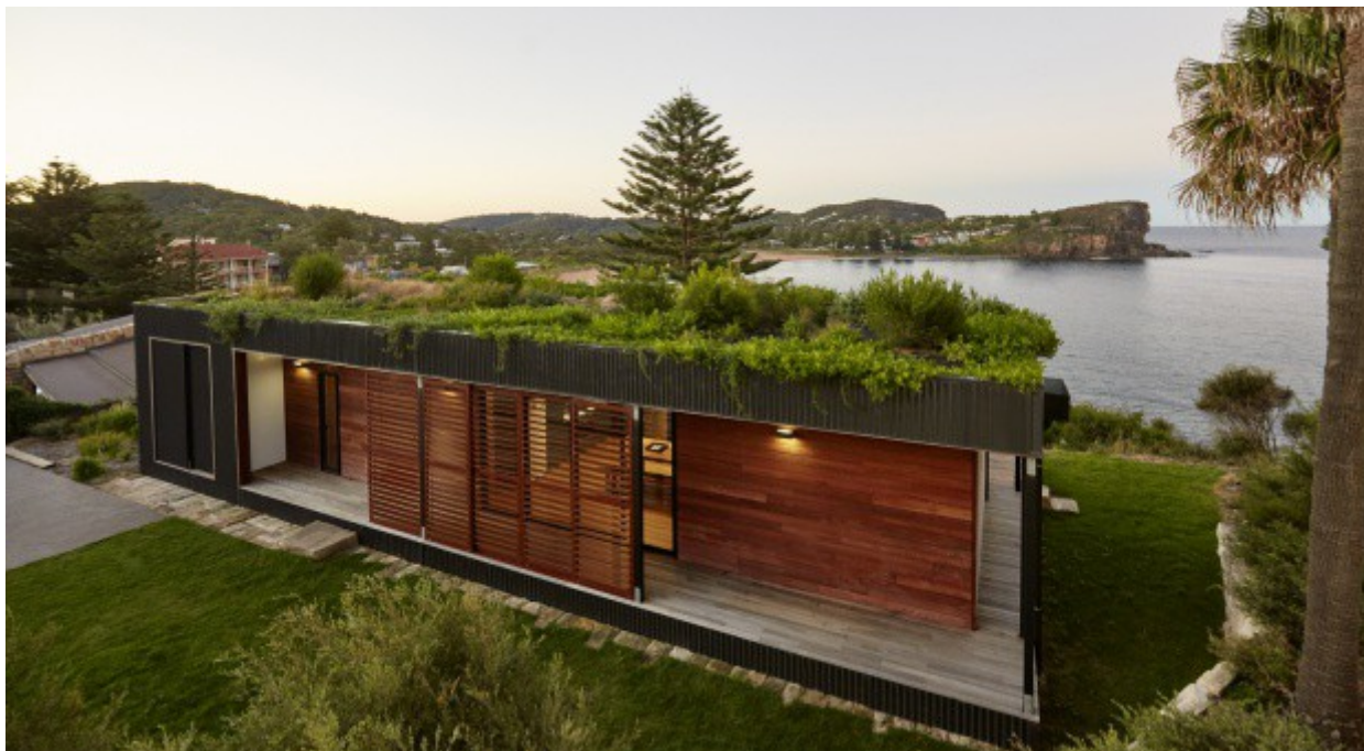
Ilustracja 1: Module house (3rd option).

https://i.najlepszedomy.pl/i/01/70/16/017016_r2_620.jpg