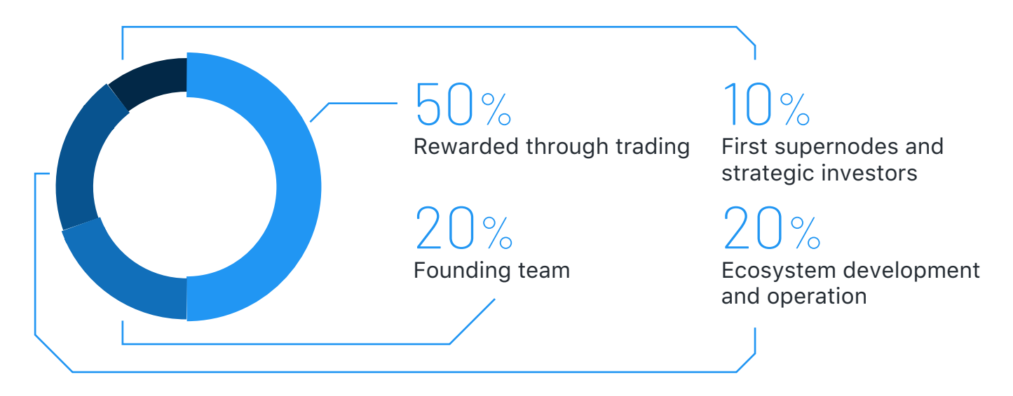
Figure 1. BGG Token Distribution