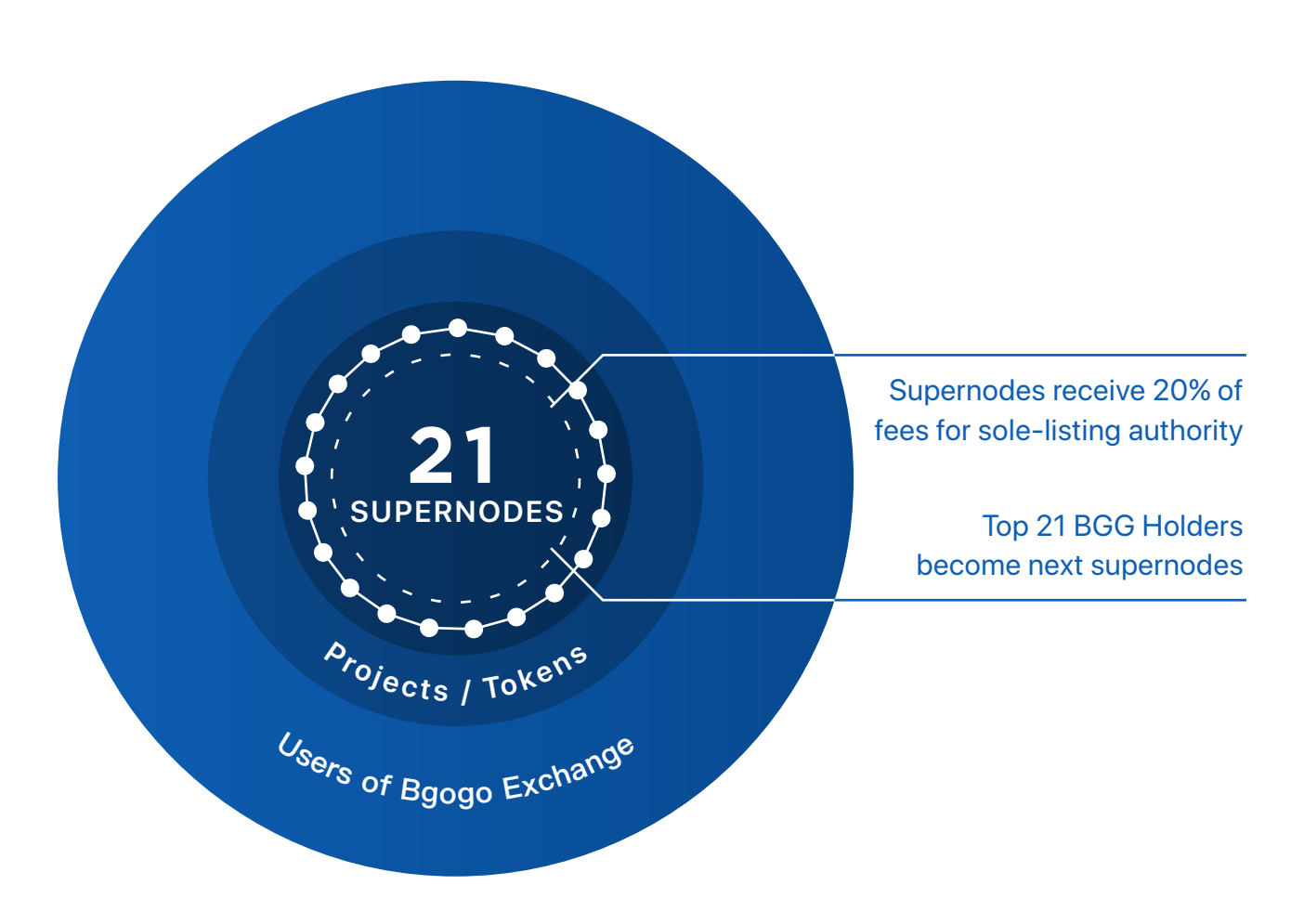
Figure 4. BGG Supernodes Ecosystem

A daily snapshot of all individual accounts on our platform will be taken at 00:00 (UTC+8). This will be utilized as criteria for supernode re-election. Based on the daily weighed calculation of BGG positions held in each account, we will obtain a ranking of total BGG holdings in one quarter. The top 21 accounts of that ranking who pass KYC verification will be eligible to obtain supernode status in the following quarter. If a prospective supernode is ineligible or declines to undertake the status, the status will be granted to the next BGG holder in-line as determined by the ranking of that quarter.